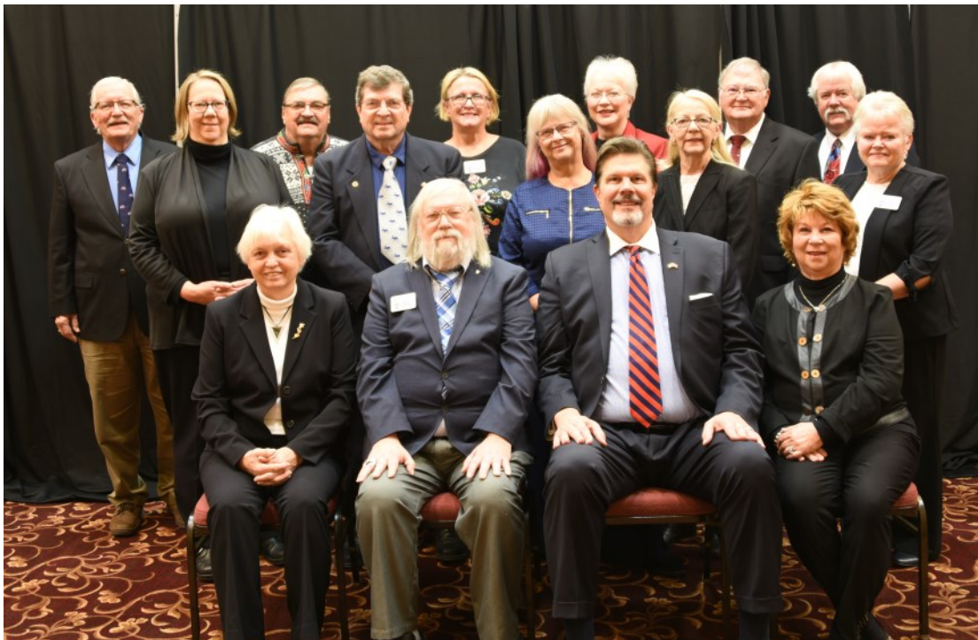
Your District 1 Officers and Directors (The District Board as installed at 2018 Convention)